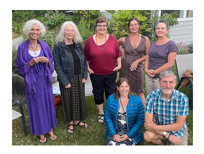
Board of Directors and Staff

Our dedicated board and staff were so glad to get together in person recently after over a year of zooming that we had to take a photo! Look at those smiles;).